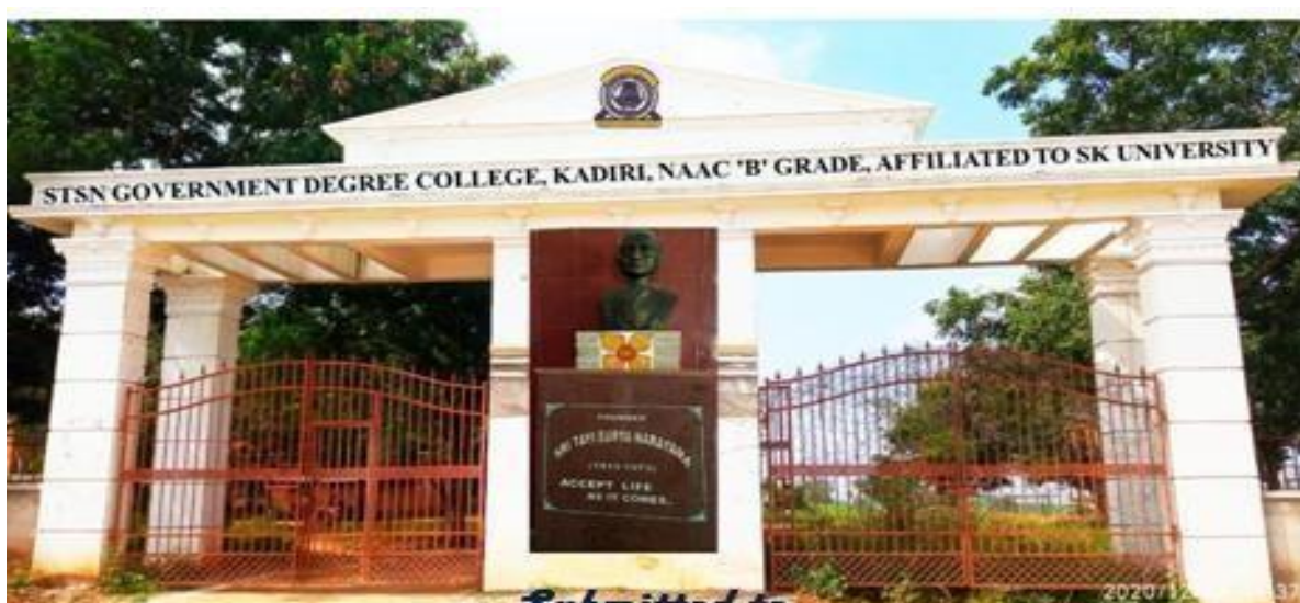
COLLEGE GATE WAY--TO KEEP YOU IN HEIGHTS

4.1.2 - The Institution has adequate facilities for cultural activities, sports, games (indoor, outdoor), gymnasium, yoga centre etc.