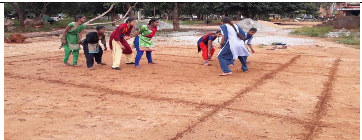
Practice with a Purpose..