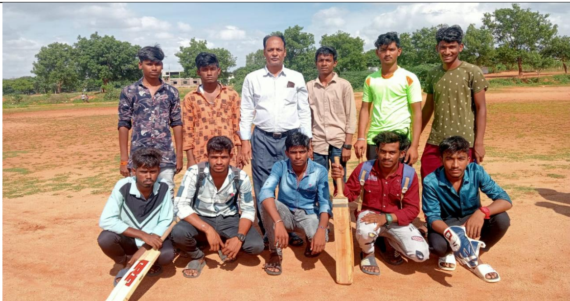
Physical Director and the Cricket Players at the College Cricket Pitch