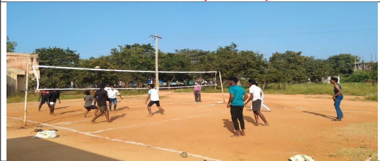
Team Work makes the Dream Work