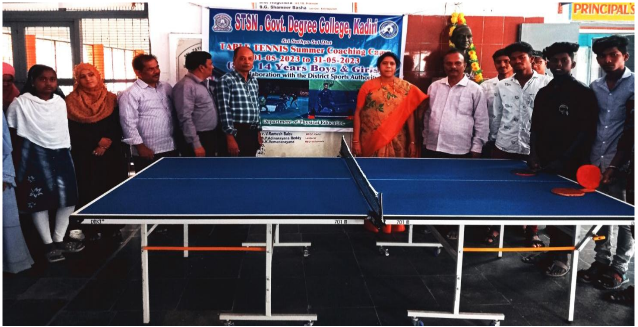
TABLE TENNIS Summer Coaching Camp-2023 from 01-05-2023 to 31-05-2023