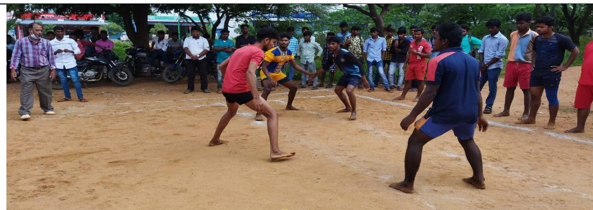
..Play with a Passion