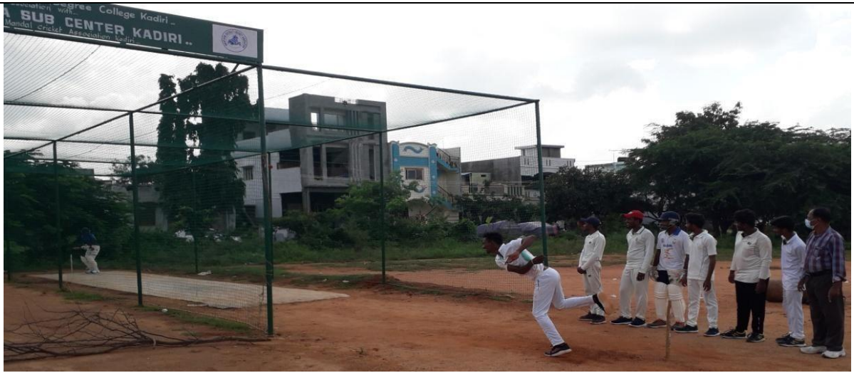
Practice..Practice...Makes a Perfection