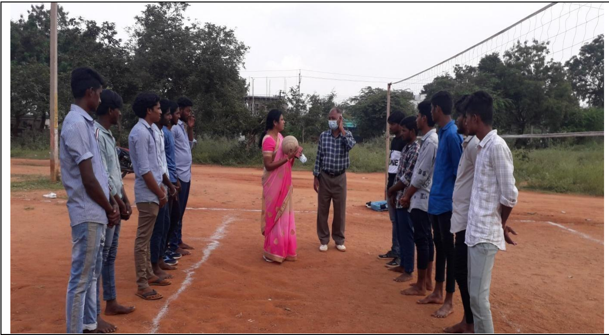
Take it to the Net....Players of Valley ball