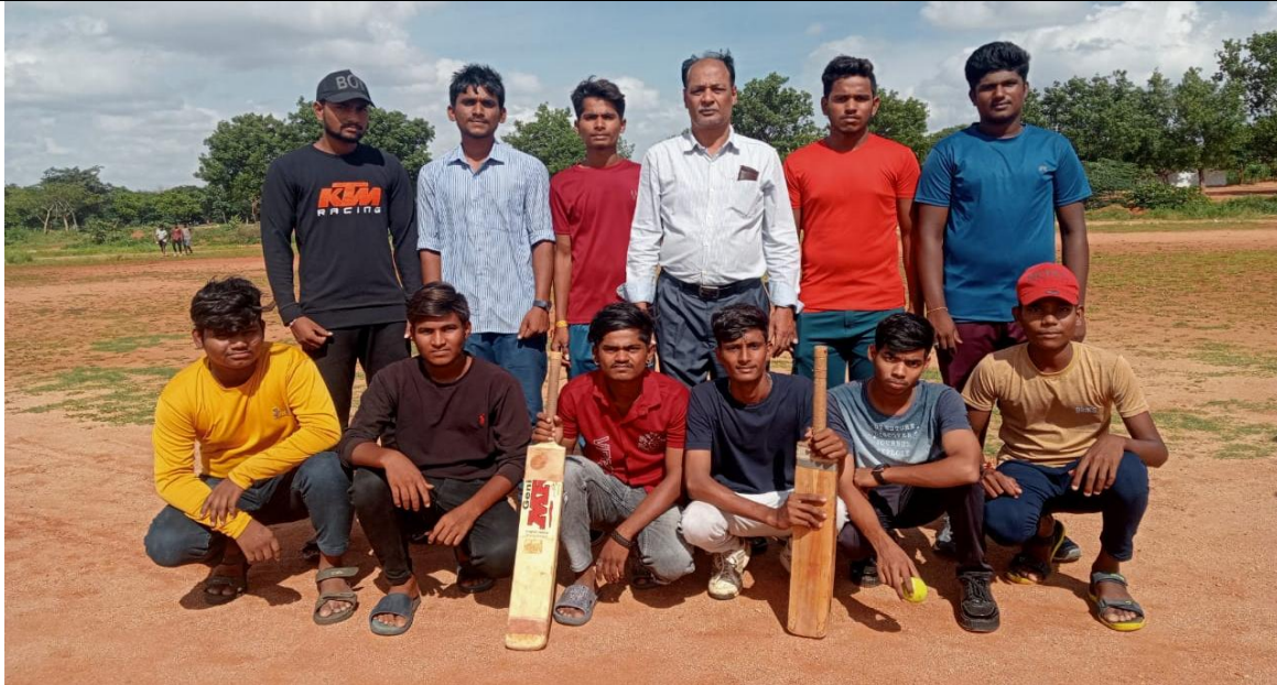
Winners -They just don't give up