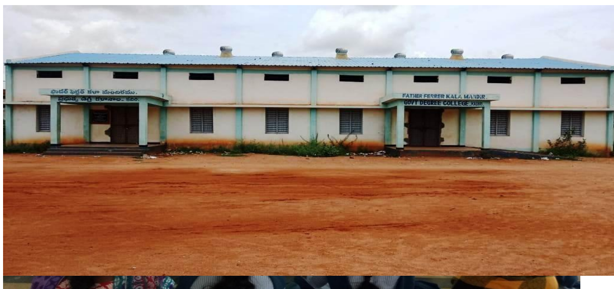
FERRER AUDITORIUM-TO EXPLORE THE LATENT TALENTS